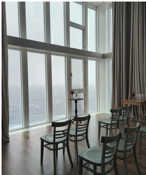
FLAT EARTH SUITE