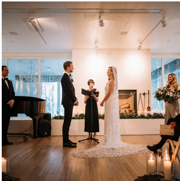
THE GATHERING HALL